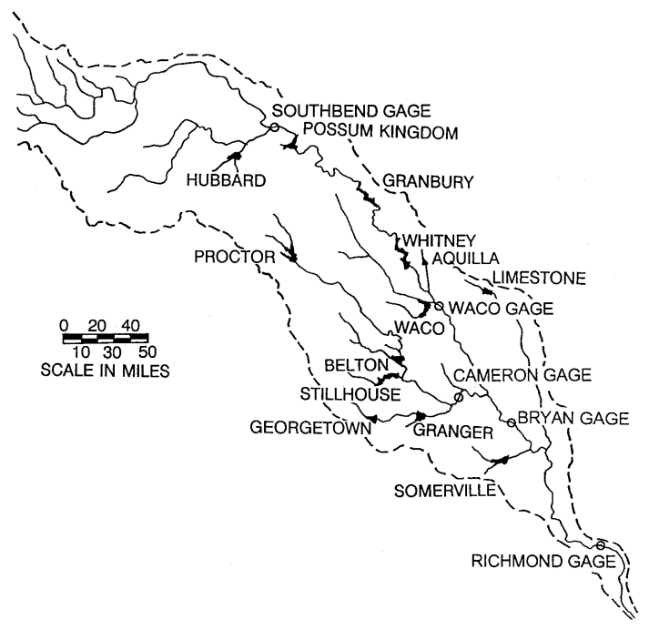
Fig. 4. Brazos River Basin

More than 1,000 water districts, cities, companies, and individuals hold water right permits to use the waters of the Brazos River and its tributaries. Based on the Brazos WAM, water rights associated with the 13 reservoirs shown in Fig. 4 account for 74% of the conservation storage capacity of the 711 permitted reservoirs and 33% of the permitted annual water supply diversion volume in the basin. The BRA owns and operates Possum Kingdom, Granbury, and Limestone