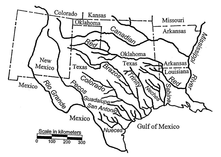
Fig. 2. Major Rivers of Texas

WRAP simulates water resources development, management, regulation, and use in a river basin or multiple-basin region under a priority-based water allocation system. The model facilitates assessments of hydrologic and institutional water availability and reliability in satisfying requirements for environmental instream flows; municipal, industrial, and agricultural water supply; hydroelectric energy generation; and